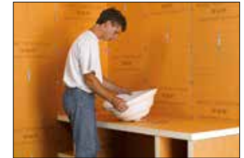
• For vanities and shelving