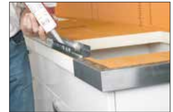
• For kitchen work surfaces