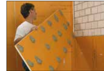
• On green masonry or mixed substrates