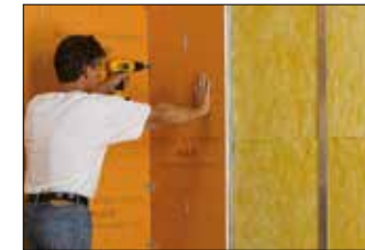
• On stud frame structures