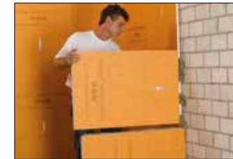
• For partition walls