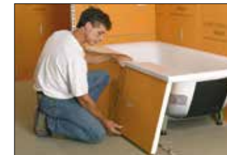
• For panelling bathtub surrounds