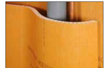
• For creating curved wall surfaces