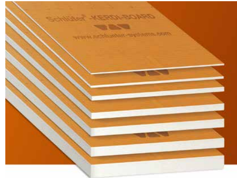
Substrate, structural panel, bonded waterproofing