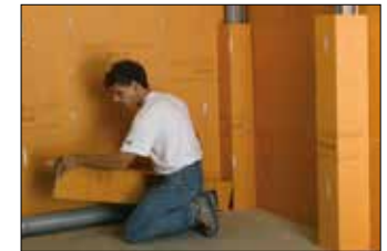
• For concealing pipes