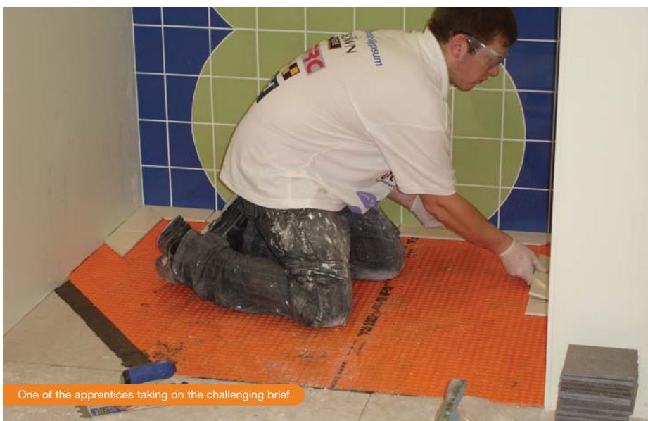
One of the apprentices taking on the challenging brief